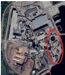
Overview image of risk area.

The probability of being infected is low. Risk groups for infection are individuals with underlying diseases or individuals with weakened immune systems. Aerosol formation can take place, for example, as a result of mechanical aeration of an aqueous phase, high-pressure flushing of equipment, overflow with splash risk and more. Personnel who are to perform function tests of emergency showers must undergo a targeted health examination at the occupational health service Gruvön. Respiratory protection in the form of filters of at least class P3 must be used.